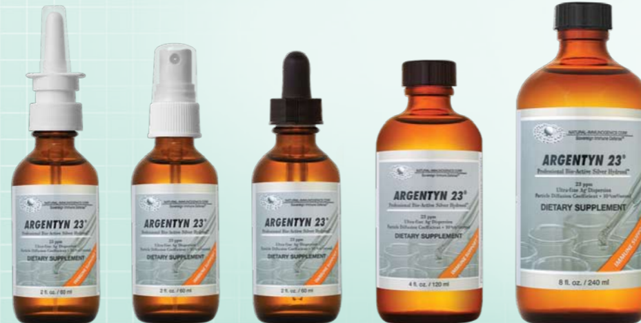
2 fl. oz. / 60 ml Vertical Spray

† According to the EPA (CASRN 7440-22-4) daily Oral Silver Reference Dose (RfD) applied to 23 ppm, one may ingest 76,650 dosages safely over 70 years.