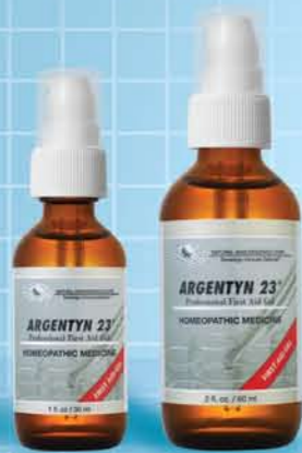
1 fl. oz. / 30 ml First Aid Gel

Keep one bottle in your bathroom cabinet, one in your car, and one in your purse or briefcase, so you'll always be prepared for life's little accidents.